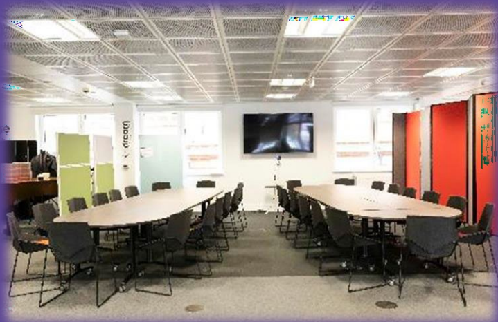
Fabulous Learning lounge space!