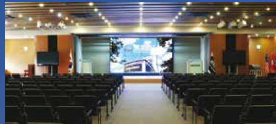
A Multimedia Conference Room