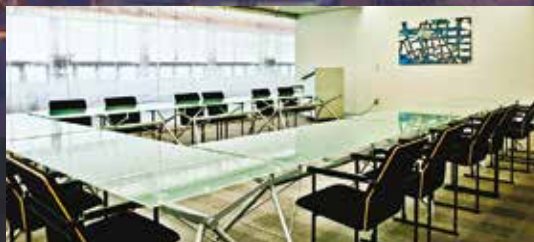
State of the Art Classrooms